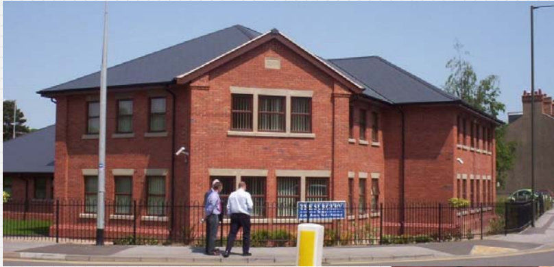
Ashbourne Medical Centre